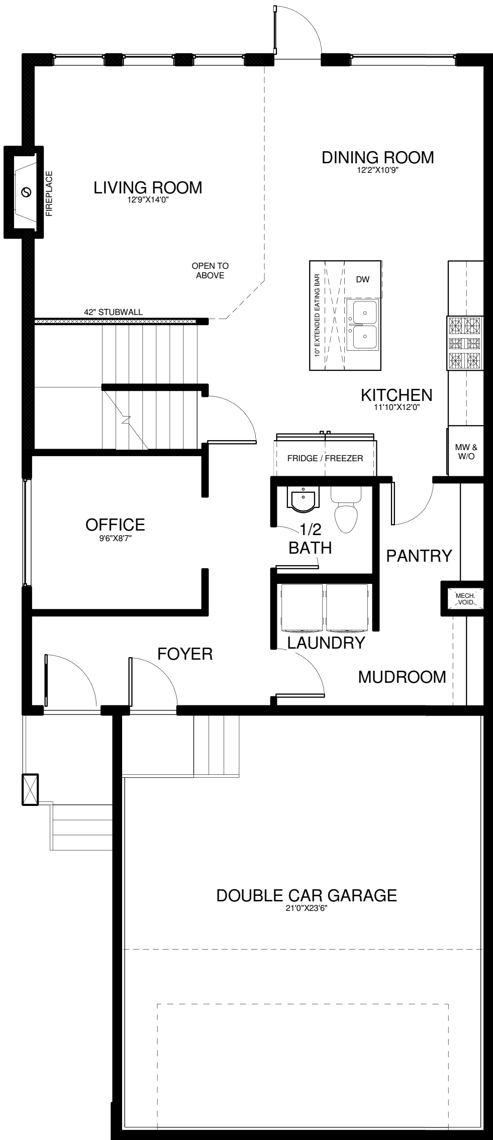
MAIN FLOOR 954 SQ.FT.